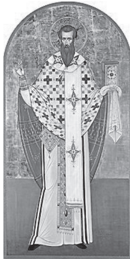
St. Basil the Great