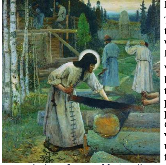
Painting of Venerable Sergii

What hinders us from receiving this Kingdom? We are hindered by the lack of this very spiritual poverty, the lack of awareness that we are the most sinful of all people. Although we might pronounce those words at times and say, "I am the worst of all people," only one encounter with simply some unfavorable circumstances is enough to convince us that this is not so. It is very easy to test it. As soon as some one close to us says an unkind word to us, criticizes us, or points out some personal fault of ours, our soul immediately feels insulted and flares up with resentment. This is a clear sign that we do not have an